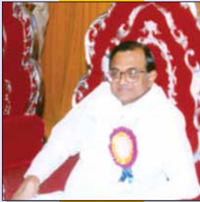
Sri P. Chidambaram, Union Finance Minister, at the 1st Snatak