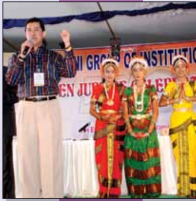
His Excellency Sri Korn Dabbaransi, Former Dy. Prime Minister of Thailand on Golden Jubilee Celebrations