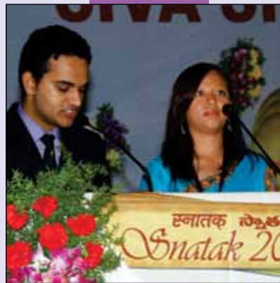
Students Welcoming Guests