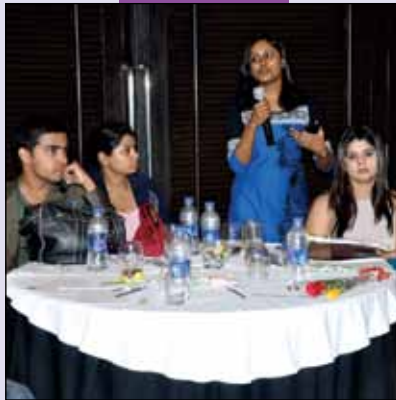
Bangalore Alumni Chamber of SSIM