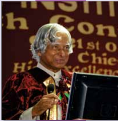
His Excellency Bharat Ratna Dr. A.P.J. Abdul Kalam, former President of India at 14th Snatak