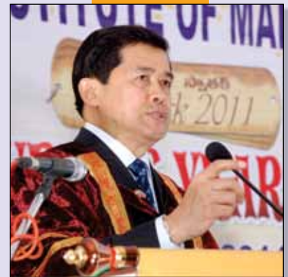
His Excellency Sri Korn Dabarasri, Former Dy. Prime Minister of Thailand, at the 17th Snatak