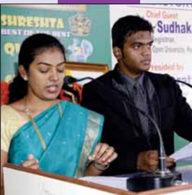
Students Welcoming the Guests