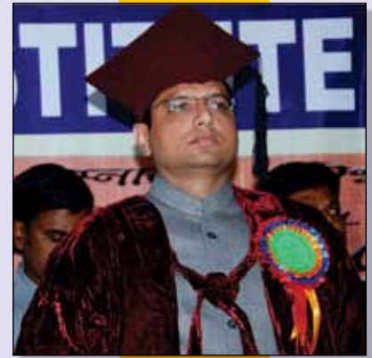
Sri Sridhar Babu, Former Minister for Higher Education, AP at the 15th Snatak