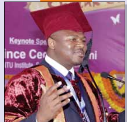
HRH Prince Cedza Dlamini, CEO, UBUNTU Institute, South Africa at the 19th Snatak