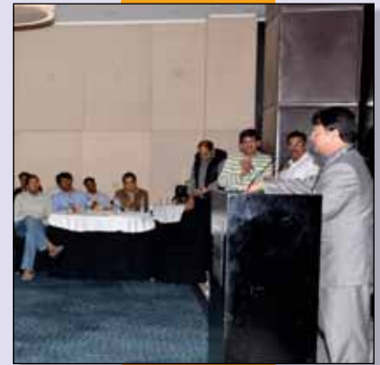
Bangalore Alumni Chamber of SSIM