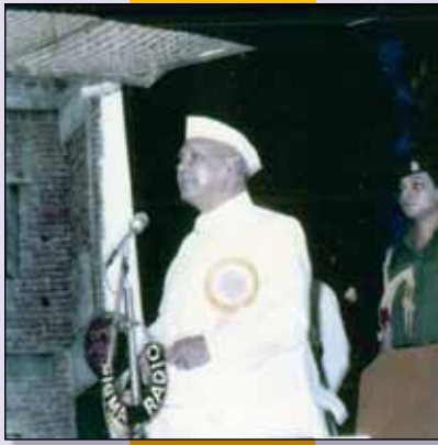
His Excellency Dr. Shankar Dayal Sharma, Former President of India, at the Silver Jubilee Celebrations of Siva Sivani Group of Institutions