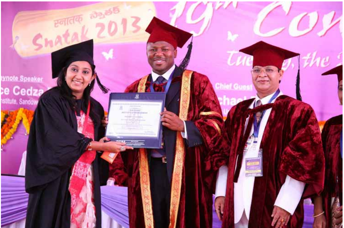
HRH Prince Cedza Dlamini, CEO, Ubuntu Institute, South Africa at Snatak 2013.